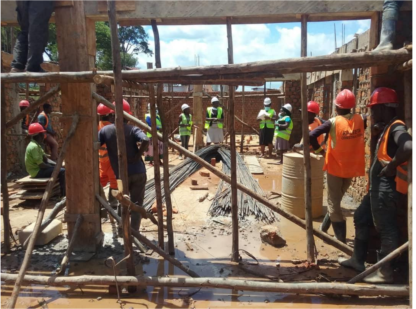
VICE CHAIRPERSON SENSITISING BUILDERS AT SUMBWE IN WAKISO SUBCOUNTY