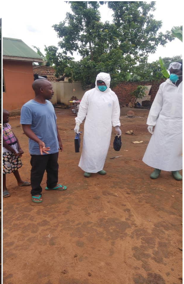
DISTRICT HEALTH OFFICIALS ON DUTY IN MENDE SUBCOUNTY